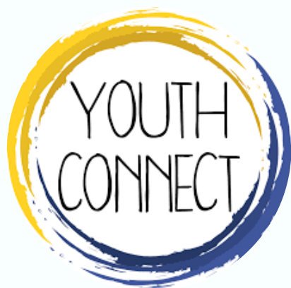
Italy - YouthConnect