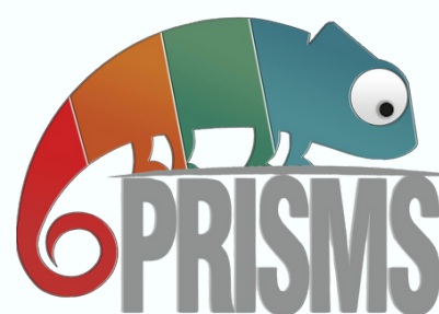
Malta - Prisms