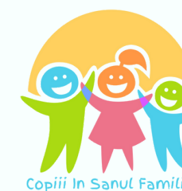
Romania - CSF